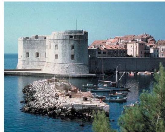
Dubrovnik, Croatia

Poland: While summer brings crowds and higher rates, so can Poland's popular ski season (winter and early spring). Festivals occur year-round, from January's Warsaw Theater Festival to the Mozart Festival in June and July. Visit in the fall for a multitude of cultural activities and lower travel rates.