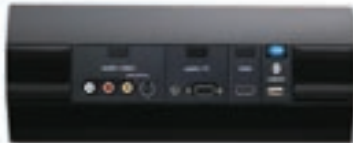
Curved Aluminum | Gloss Black