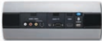
Curved Brushed Aluminum