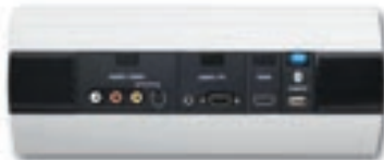
Curved Aluminum | Gloss White