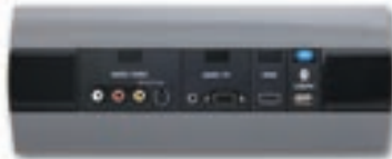
Curved Aluminum | Gloss Grey