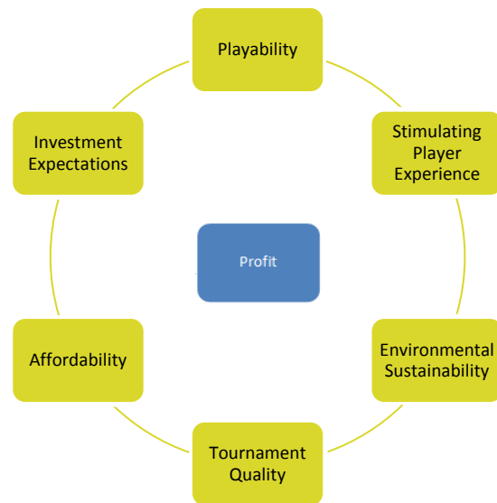
FIGURE 2: THE OPERATIONAL CHALLENGE

If funds are not immediately available to construct a full 18-hole course, it is sometimes thought that capital may be deployed more effectively in the creation of a nine-hole course or ‘court’ of international standing, configured with innovative greens and a variety of tees to enable it to be played in two or more layouts. A second nine holes may then be developed alongside at a later date. Whilst this option has its place, we would urge caution owing to the potential delay in the resort’s penetration into the market.