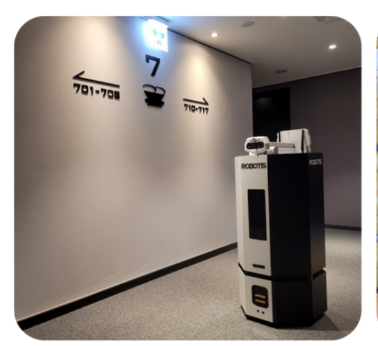
Henn na Hotel

GAEMI enables hotels to provide the best intra-facility service and small goods delivery to guests with minimum cost and complexity. In South Korea and Japan, major hotel chains such as Courtyard by Marriott , Mayfield Hotel & Resort , Kensington Hotels & Resorts , Novotel , and Ibis Styles have already experienced an increase in service related revenue thanks to the GAEMI service robot's ability to provide reliable around-the-clock food and beverage delivery, hospitality, and room service.