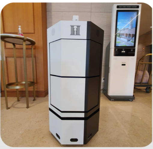
Mayfield Hotel & Resort