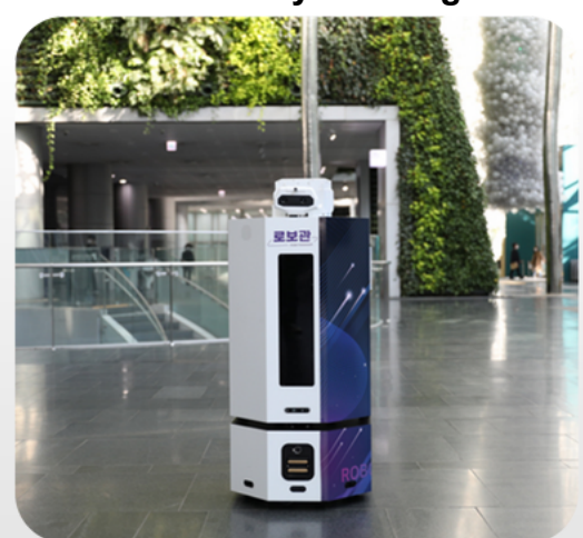
Seoul City Hall

GAEMI provides increased productivity in a variety of hotel departments, including housekeeping, food and beverage, and security. GAEMI helps to enhance the guest experience by providing personalized 24/7 hospitality services, including curbside pickup and direct service to guest's rooms when guests order from food delivery platforms, such as DoorDash, ChowNow, Grubhub, Postmates, etc. GAEMI also supports hotel staff and alleviates labor shortages by autonomously carrying out routine service tasks. GAEMI increases employee and guest safety by providing contactless deliveries and conducting autonomous security patrols. These varied capabilities contribute to improving overall operational efficiency and reduced staffing requirements, all while providing a wonderful and consistent guest experience.