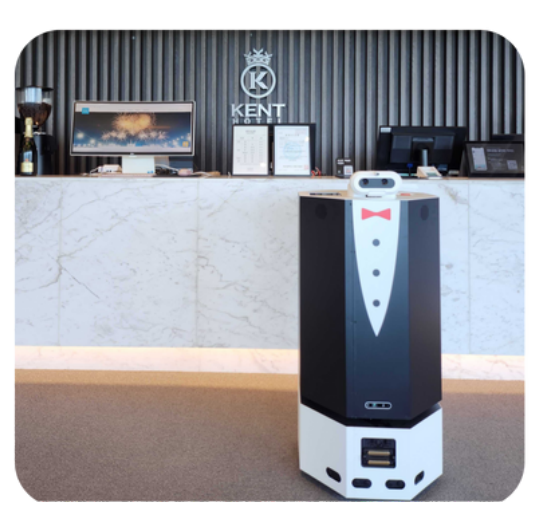
Kent Hotel by Kensington