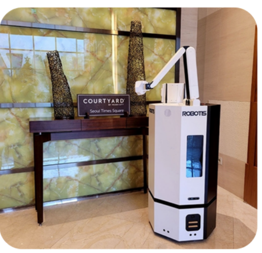
Courtyard by Marriott